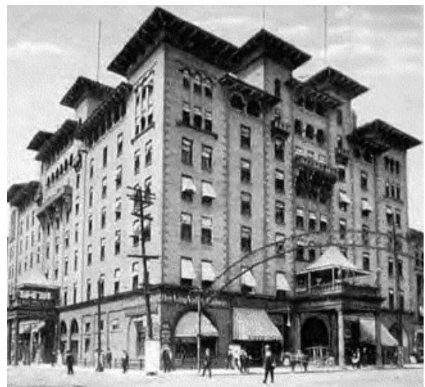
The Chittenden Hotel at Spring & High, reviewing stand for the parade.