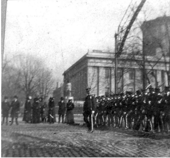
The Hibernian Rifles march up High Street in front of the Statehouse.