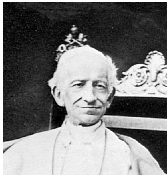
Pope Leo XIII, who formally initiated the social teaching of the Church in Rerum Novarum.

Gioacchino Pecci was ordained a priest on December 31, 1837, and a few weeks later he was appointed apostolic delegate of the small papal territory of Benevento, Italy. His success there led