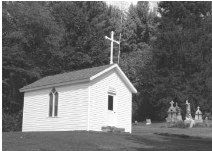
The rebuilt Royer Chapel in Franklin Township, Coshocton County